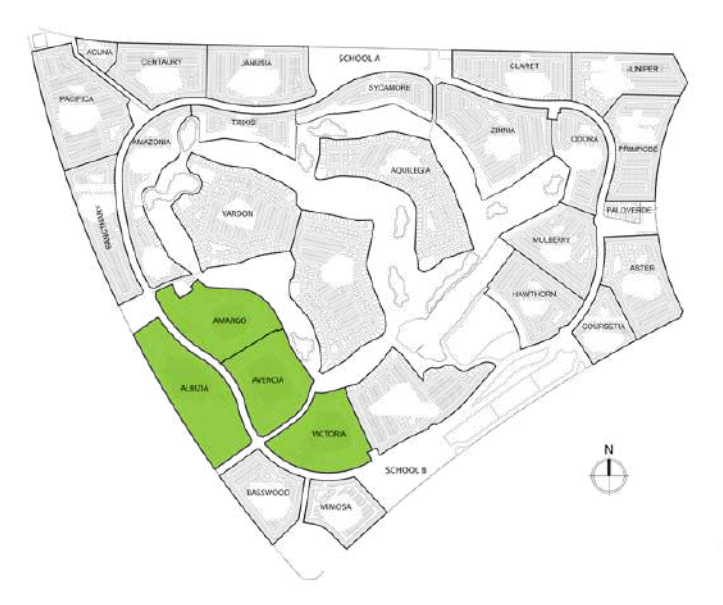
CLUSTERS: ALBIZIA, AMARGO, AVENCIA, VICTORIA