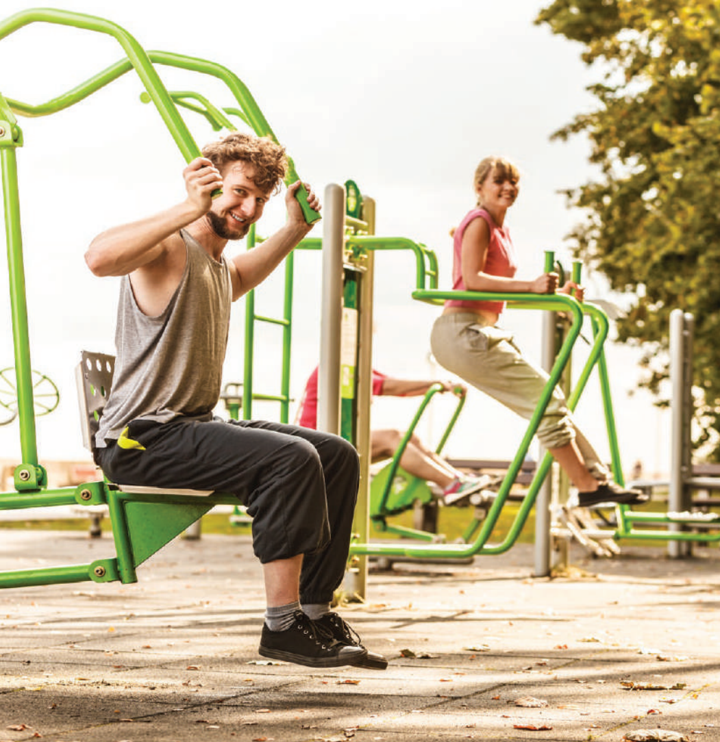
Outdoor Gym Terrace