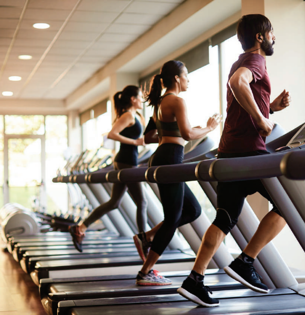
Health Club with changing rooms