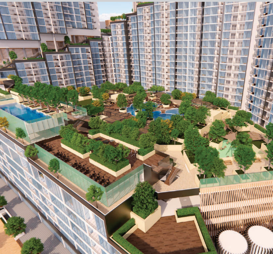
Landscaped Terraces at different levels with a host of amenities