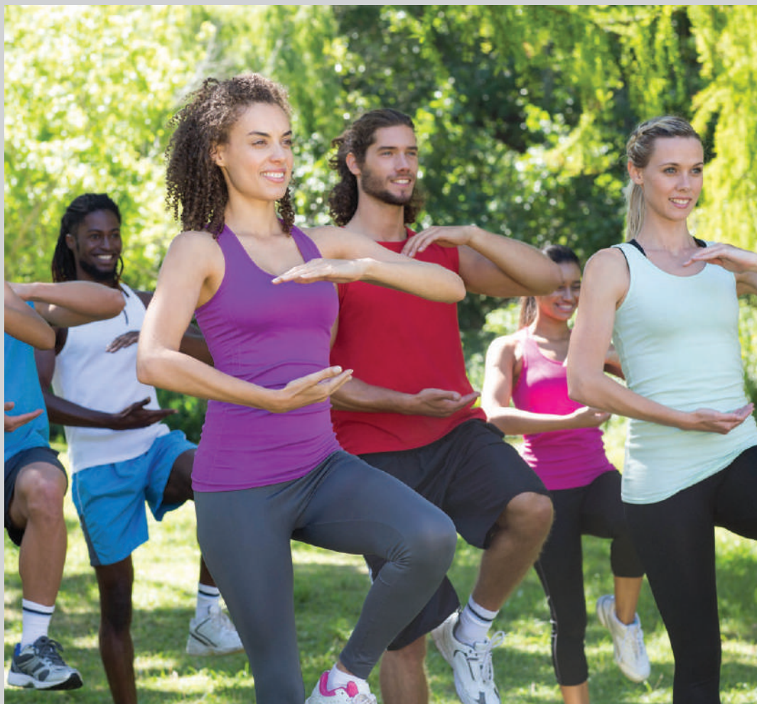
Tai Che Terrace