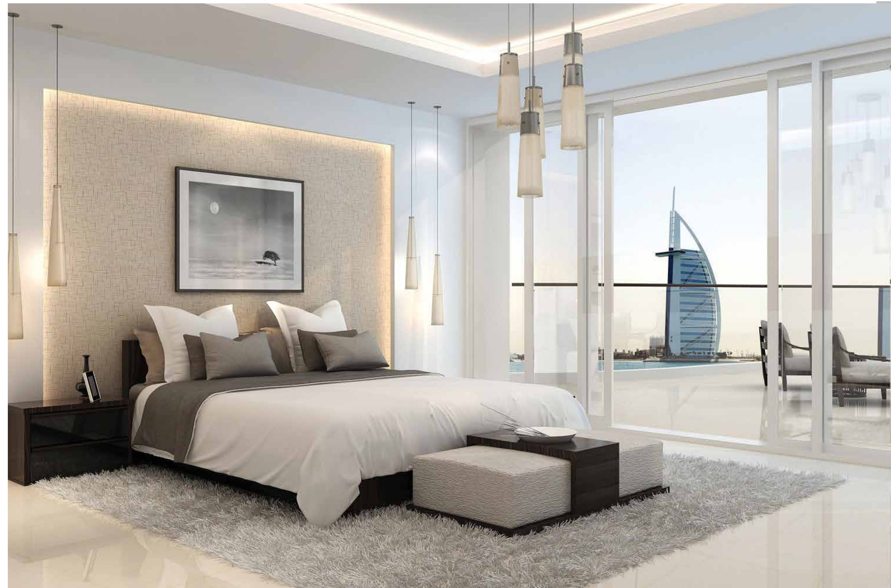
Spacious and well-designed bedrooms with floor-to-ceiling windows and large terrace provide sea view and privacy. All bedrooms are en suite.