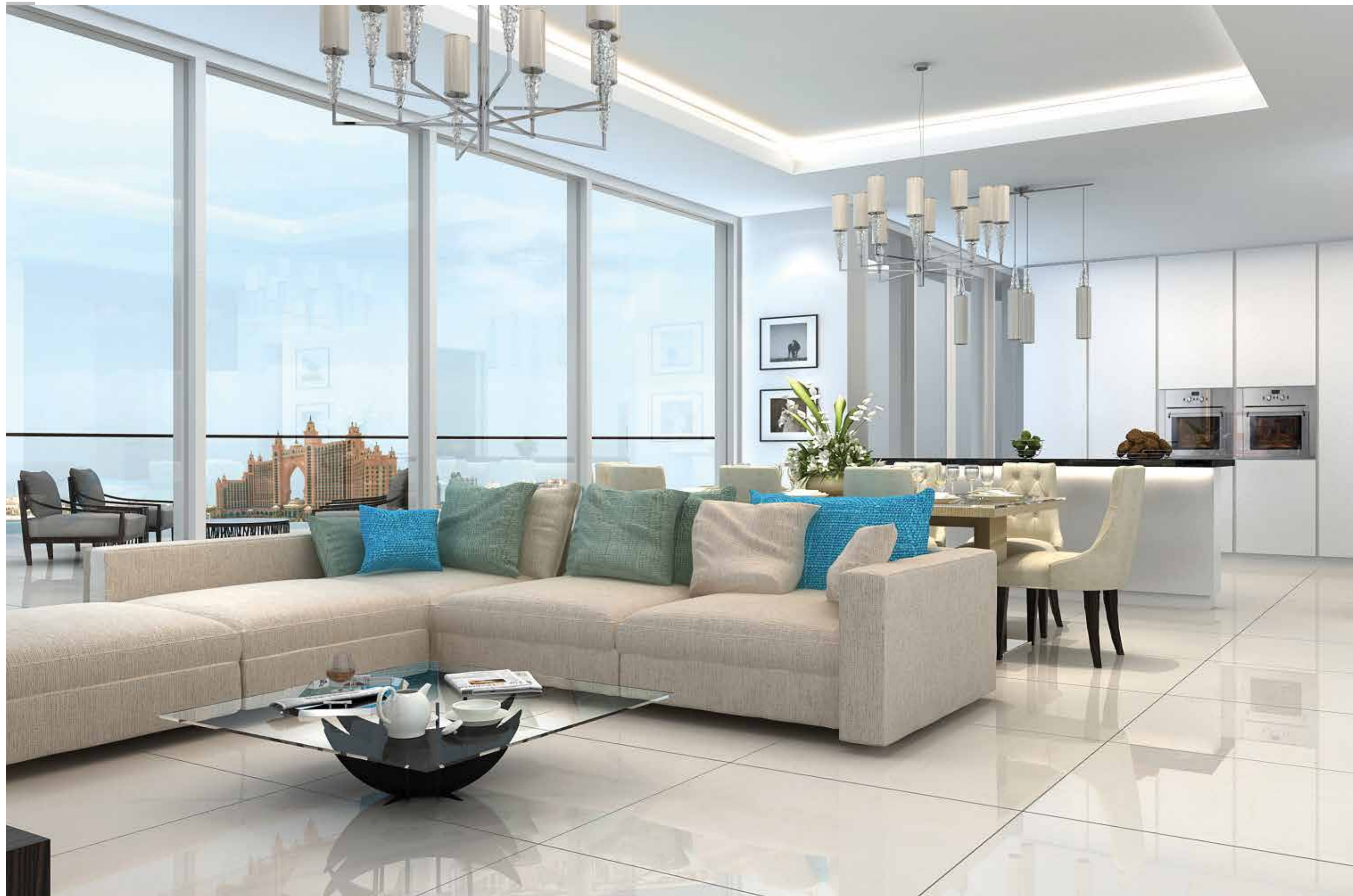
Sleek living room interiors with clean lines, neutral tones and meticulous finishes.