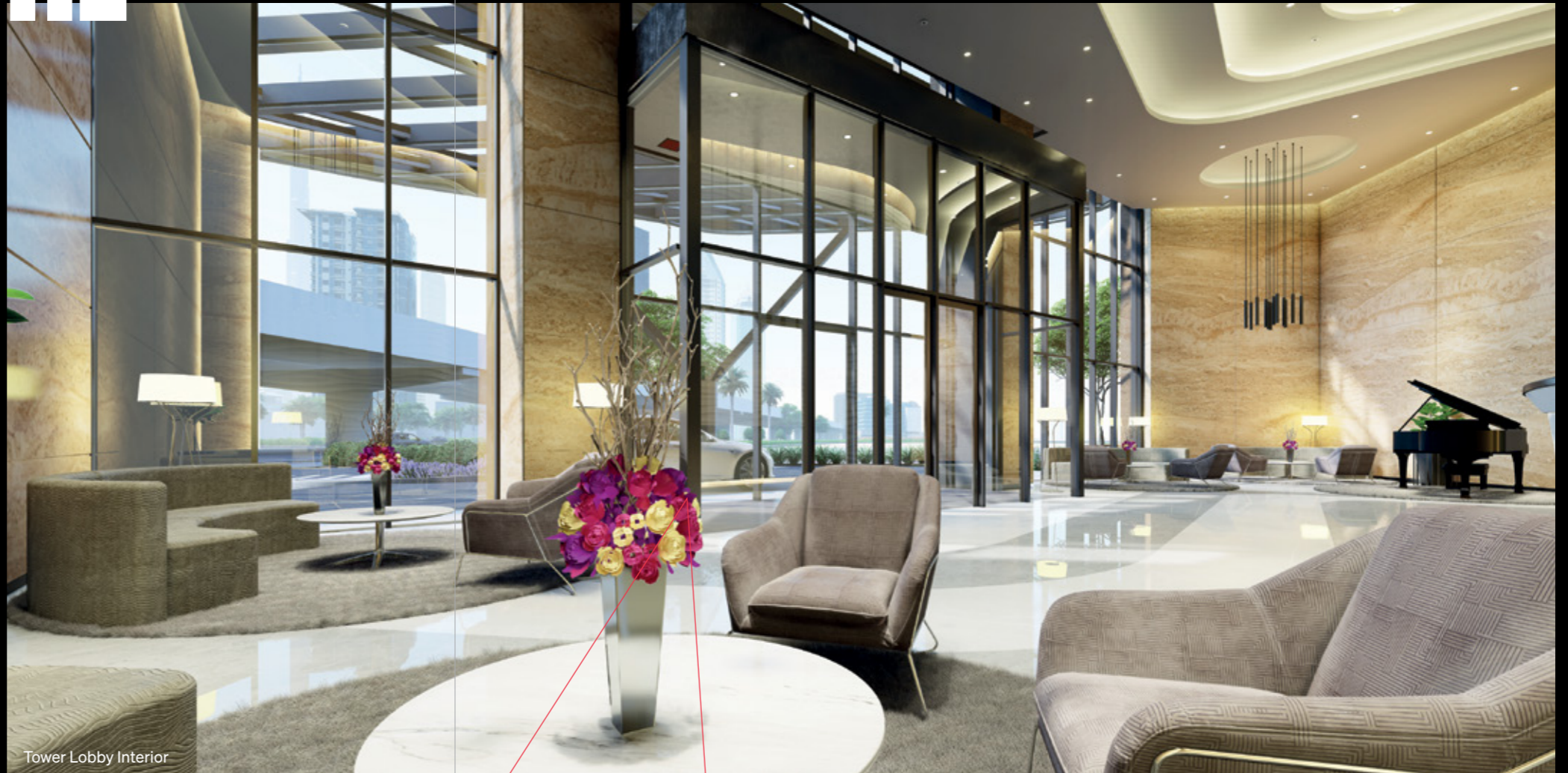
Tower Lobby Interior

THE PARAGON HAS AN EDGY URBAN ARCHITECTURAL DESIGN AND IS BUILT WITH THE HIGHEST QUALITY MATERIALS AND FINISHES, MAKING IT THE DEFINITION OF ULTIMATE SOPHISTICATION.