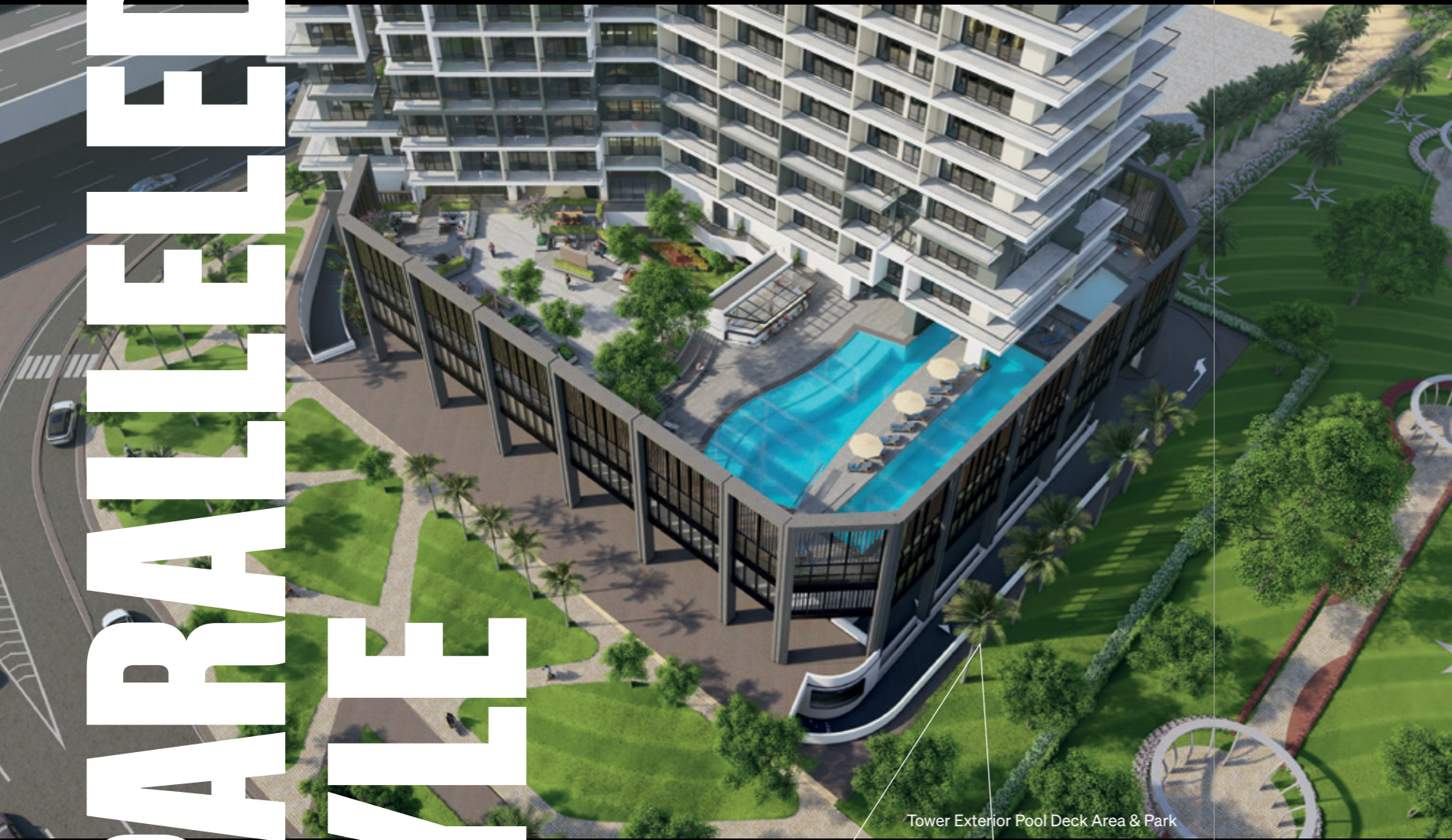
Tower Exterior Pool Deck Area & Park