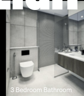
3 Bedroom Bathroom