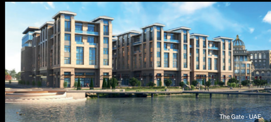
The Gate - UAE

Today, an expanded and impressive portfolio of premium properties, which includes some of the most sought-after properties by meticulous clients worldwide, serve as a testament to IGO's well-deserved reputation as one of the top regional investment companies.