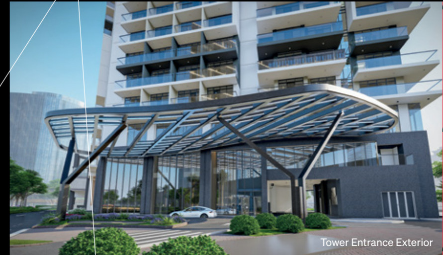
Tower Entrance Exterior