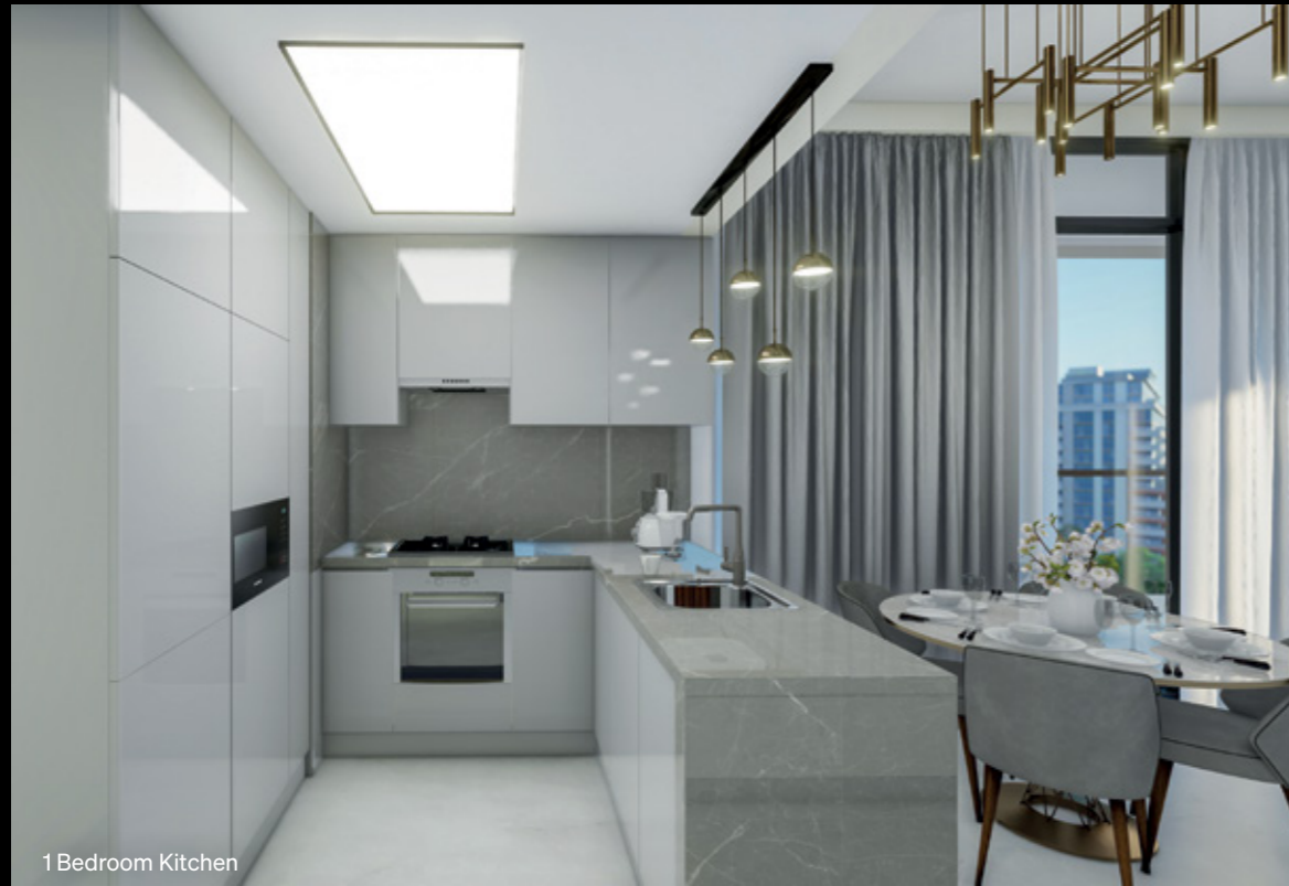
1 Bedroom Kitchen