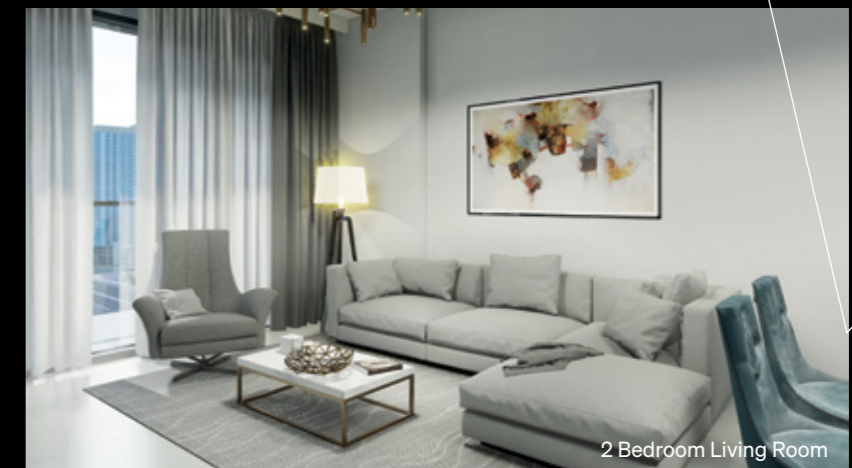
2 Bedroom Living Room

The residential towers will have parking bays allotted for each apartment, in addition to the visitor parking.