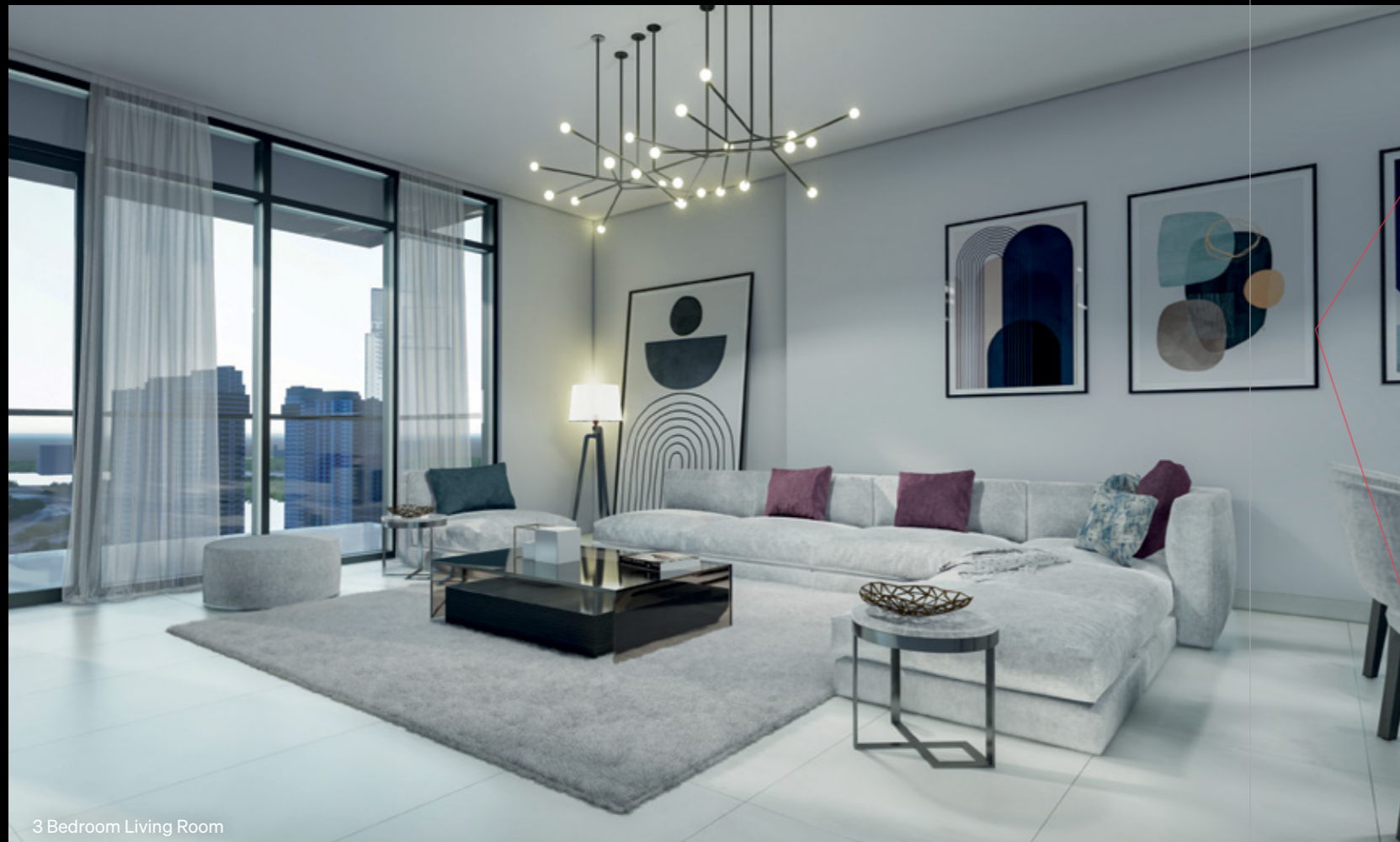
3 Bedroom Living Room