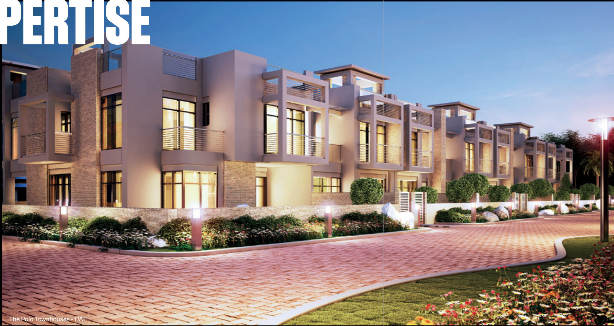
The Polo Townhouses - UAE