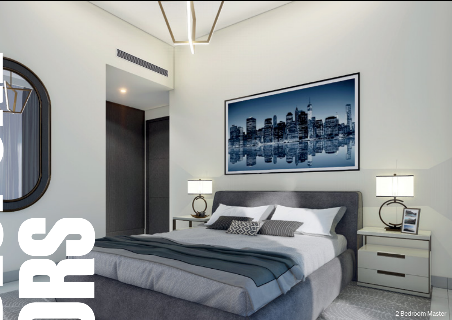
2 Bedroom Master

The Paragon apartments succeed in fusing an upmarket and stylish design with a harmonized and balanced atmosphere. Porcelain-tiled floors flow smoothly throughout each home, while European light fixtures are fitted within every room. Double glazed, floor to ceiling windows work functionally to keep out noise and heat, but also aesthetically to create a bright and open living space. The neutral color palette adds a touch of understated elegance or acts as the perfect base for owners to decorate to their own liking.