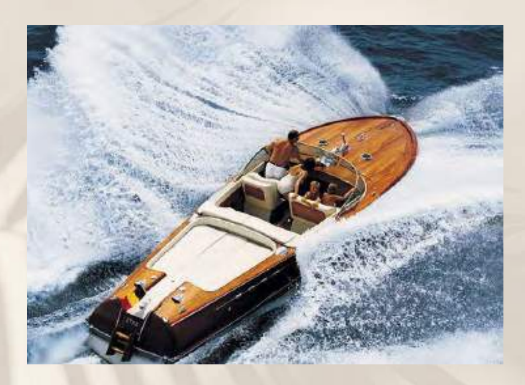
The Residence aims to create a new standard of luxury living, and to make a lasting imprint.