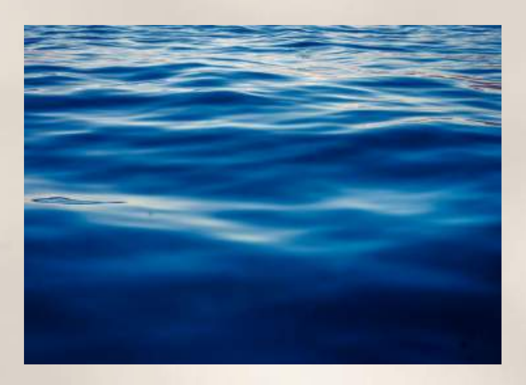
Bringing to life the concept of "Villas in the sky".

Inspired by the smooth and rhythmic curves of the water canal waves. With distinctive features such as infinity edge pools, double height volumes, large terraces.