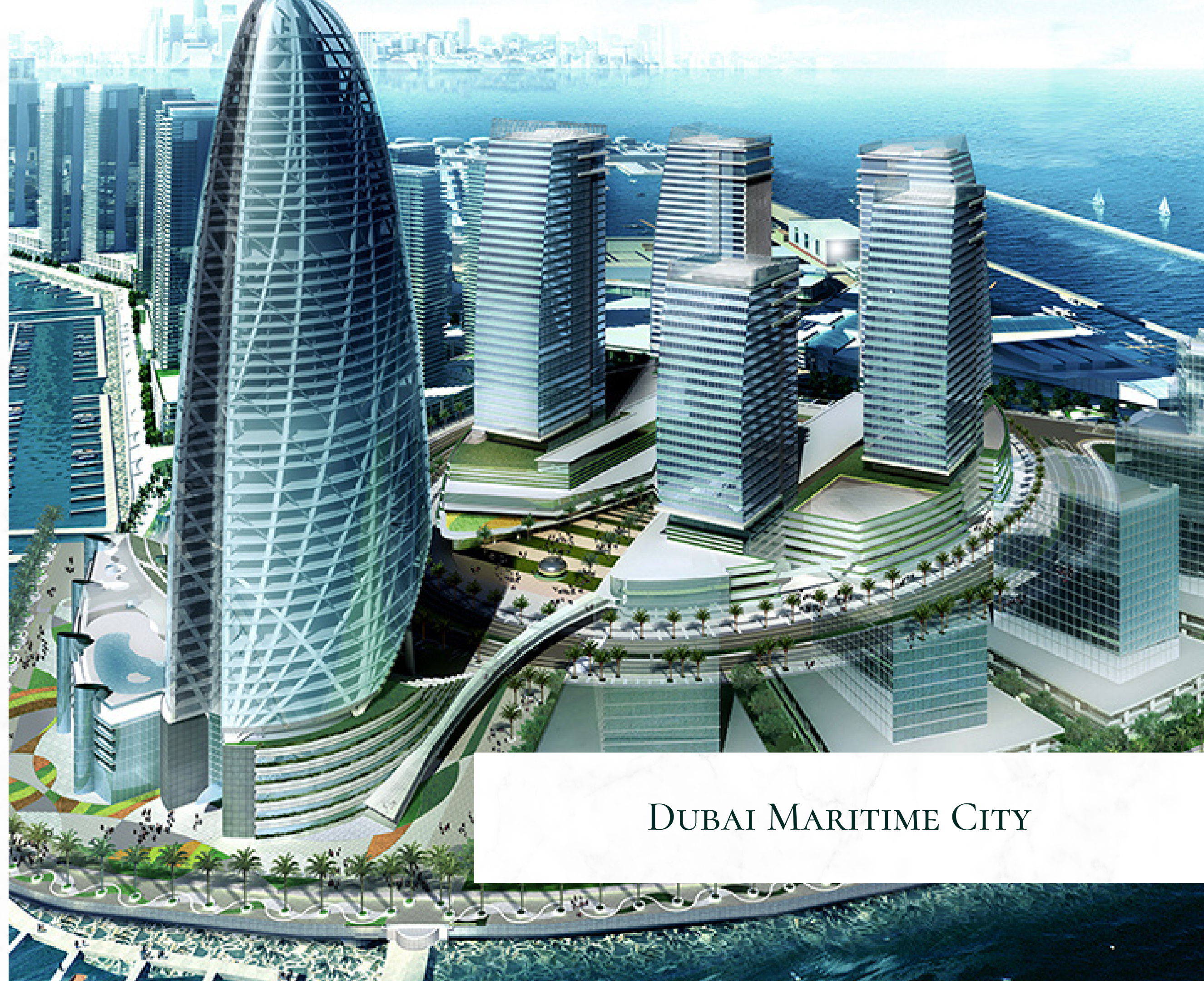
DUBAI MARITIME CITY