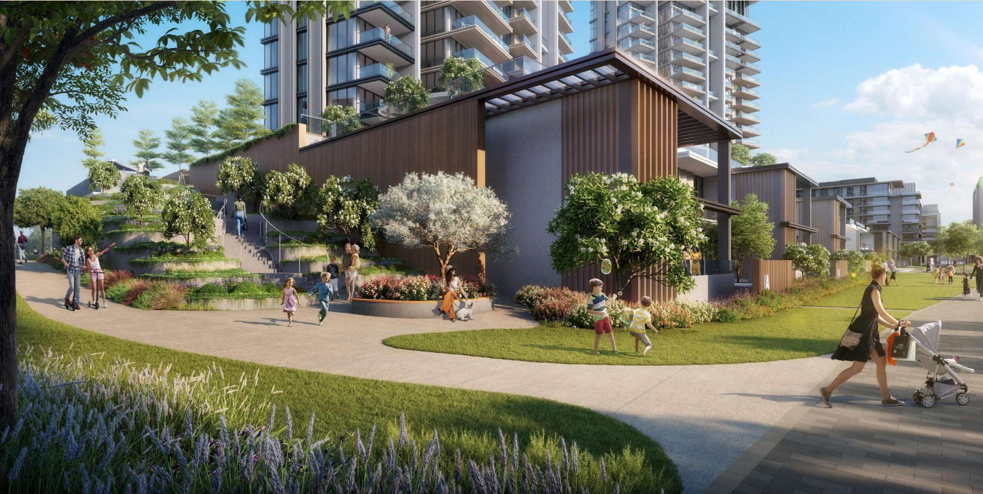
STEPPED LANDSCAPING CONNECTING THE PRIVATE AREA RESERVED FOR RESIDENTS TO THE CENTRAL PARK