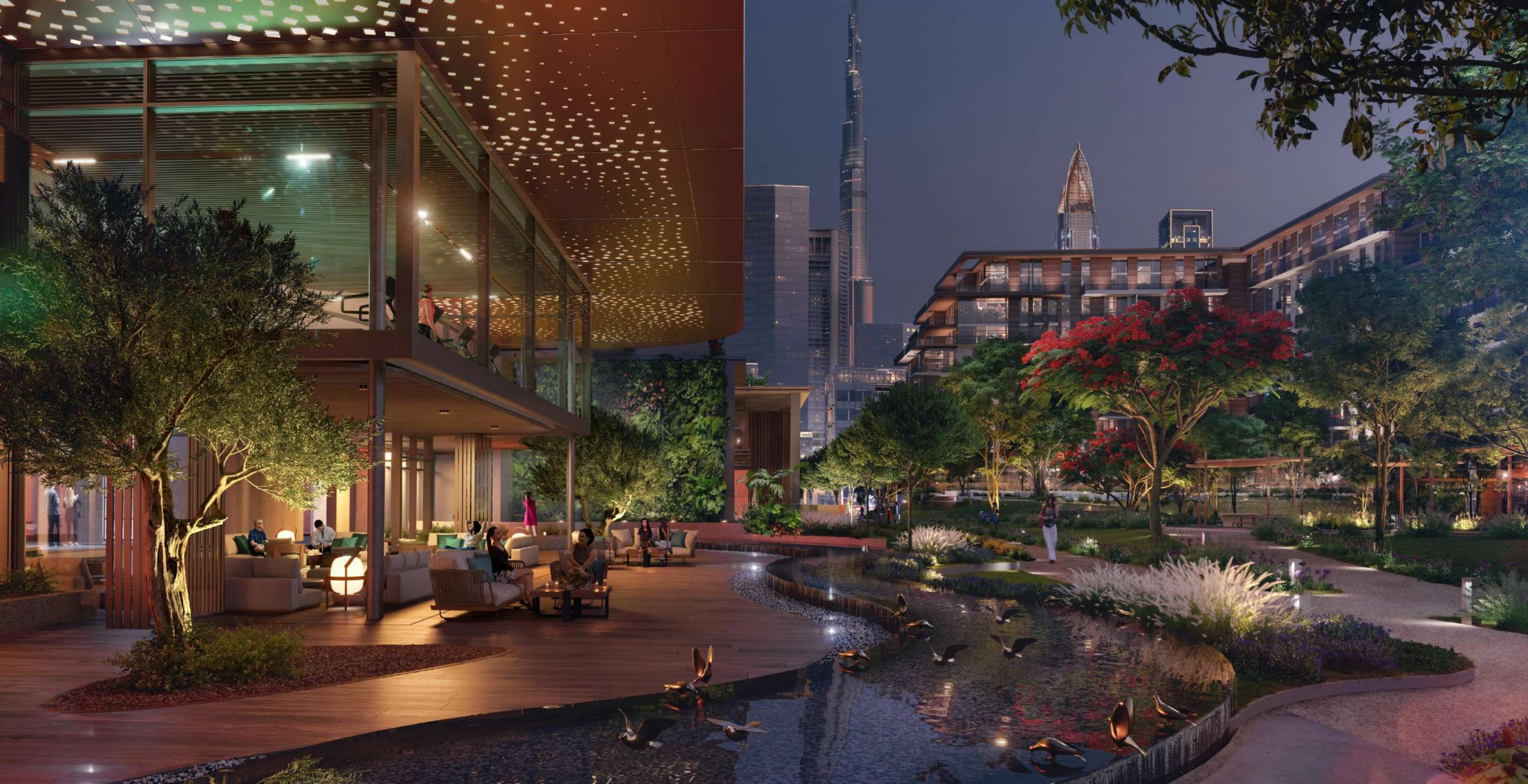
A PRIVATE INDOOR/OUTDOOR LOUNGE AREA FOR RESIDENTS, SPILLING OUT AND CONNECTING DIRECTLY TO THE PARK.