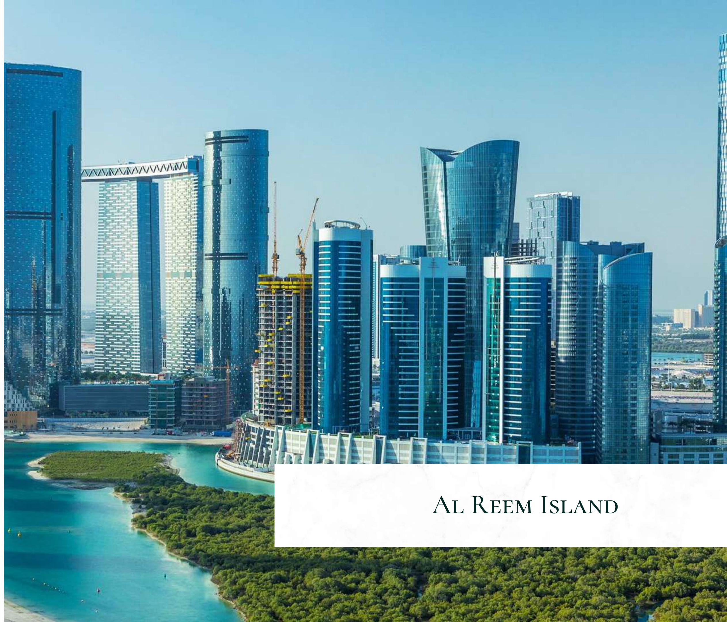
AL REEM ISLAND