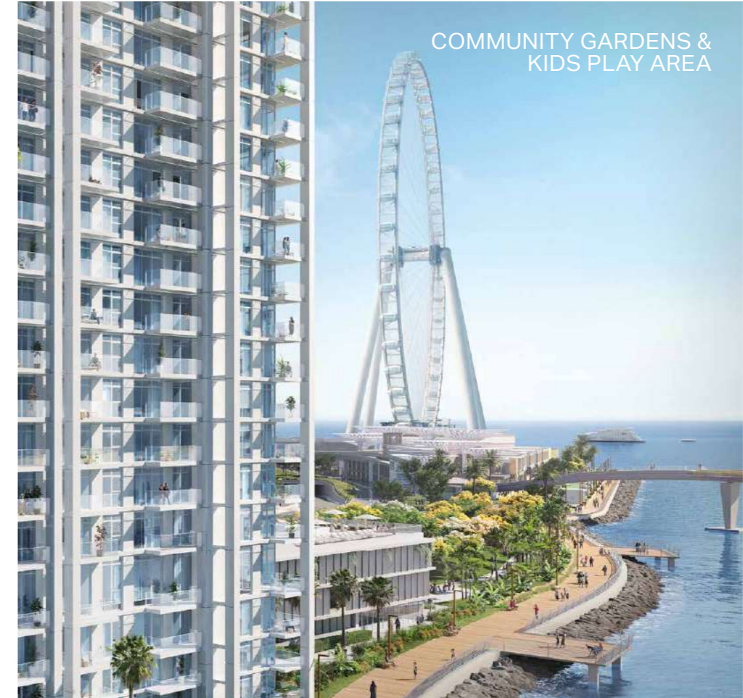
COMMUNITY GARDENS & KIDS PLAY AREA