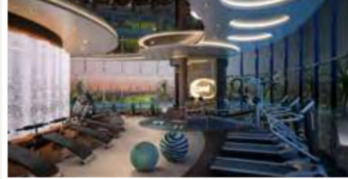
5. FITNESS CENTRE