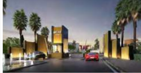
1. COMMUNITY GATE