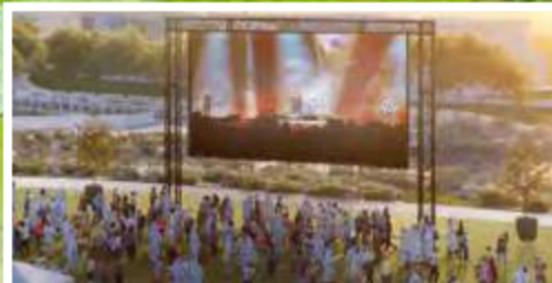
2. OUTDOOR CINEMA